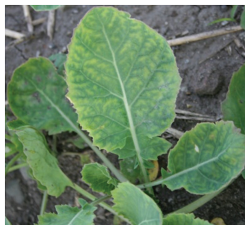
Early season Nitrogen deficiency in canola and N demand by growth stage.

290 Agri Park Road, Oak Bluff, MB R4G 0A5