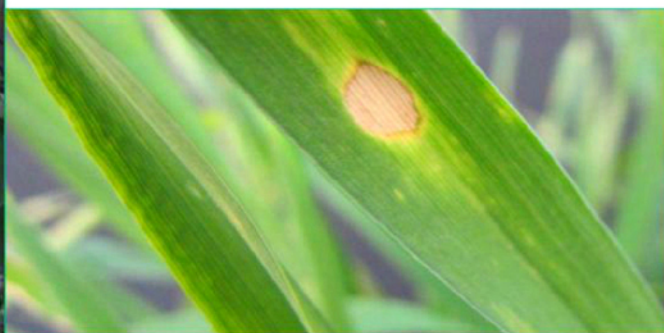
All pictures courtesy of Harvest Plus/Ismail Cakmak