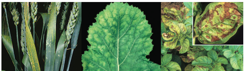
Potassium deficiency in wheat, canola and potatoes that could be corrected with K Kicker™.